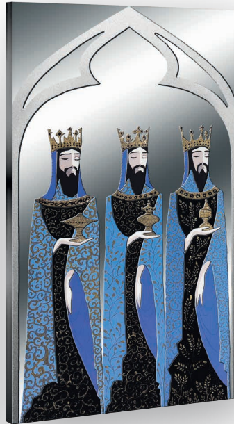
Center: Madonna and Child Right: The Magi

The Coins: The Birth of Christ This officially licensed, three-coin set is available within a specially designed presentation box that when open functions as an easel-like display case. The box's opulent crimson and gold pattern derives from an original Eyvind Earle textile design. Story cards and Certificate of Authenticity included.