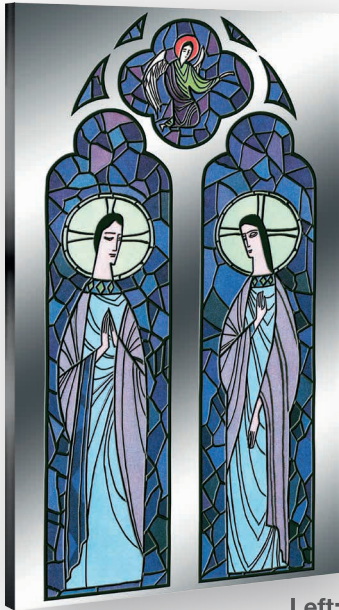
Left: Evangelists Matthew and Luke with Angel